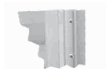
Standard Channel Frame