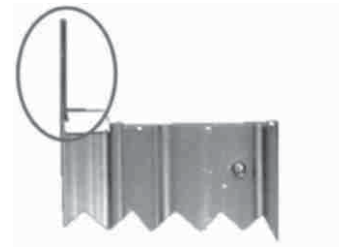
Optional Flange Frame